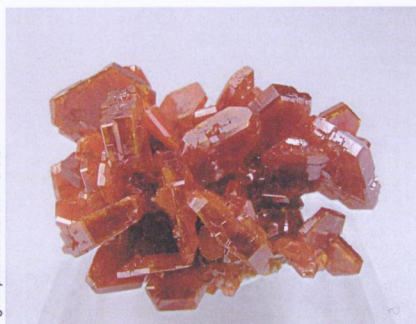
Vanadinite - Mibladen, MOROCCO