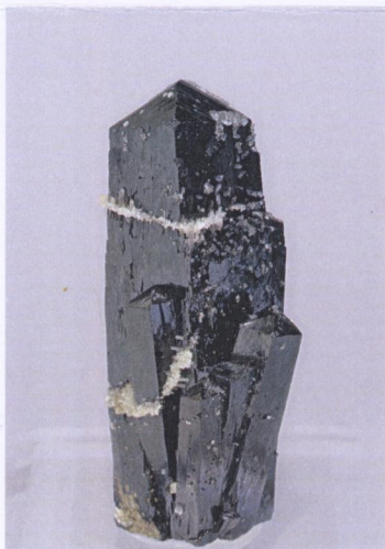
Ilvaite - CHINA