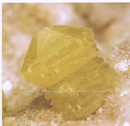
Mimetite - Tsumeb, NAMIBIA